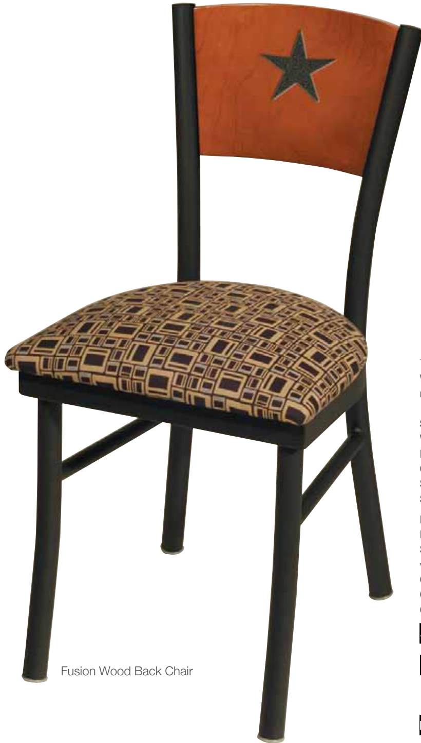
Fusion Wood Back Chair