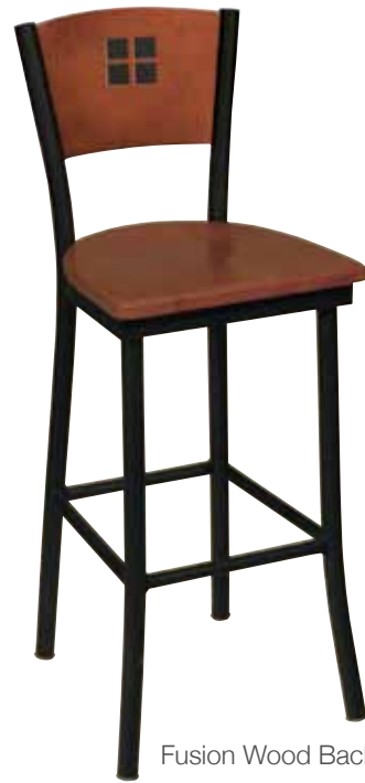
Fusion Wood Back Stool