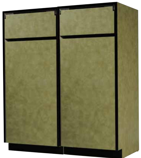
Bedford Double Wide